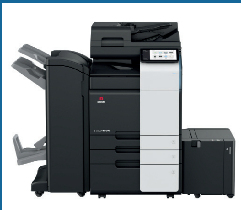
d-Color MF309 with DF-714+PC-416+LU-302+RU-513+FS-536SD

New 10.1" multi-touch operator panel, which can vibrate to provide greater touch sensitivity