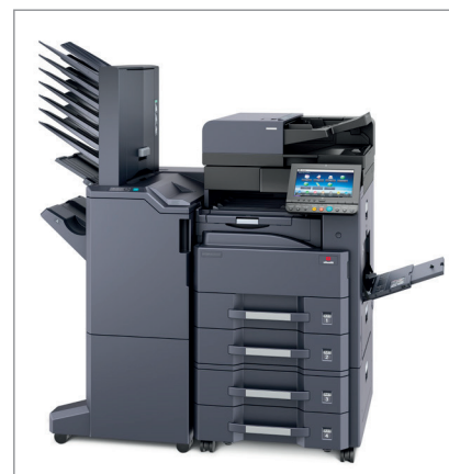
d-Copia 3201MF (or d-Copia 4001MF) + DP-7110 + PF-791 + DF-7110 + AK-740 + MT-730(B)