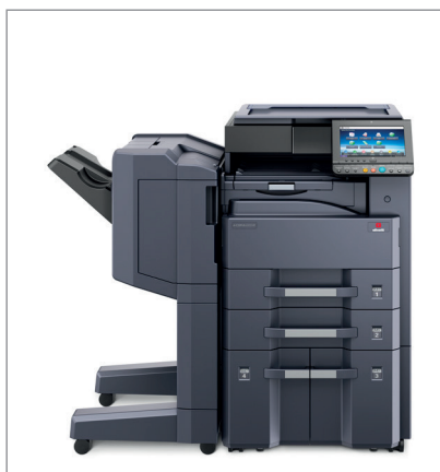
d-Copia 3201MF (or d-Copia 4001MF) + Platen Cover (E) + PF-810 + DF-7120 + AK-740